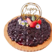
BLUEBERRY CHEESE PIE 3 POUND ฿1,550