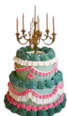
PRINCESS DIARY 2.5 POUND (GREEN) ₪2,200