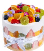
FRESH FRUIT SHORTCAKE 2 POUND ₪1,800