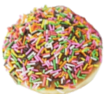
DONUT OVALTINE SPRIKLE ฿90