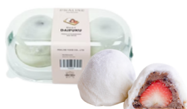
DAIFUKU STRAW RED BEAN ฿170