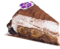
BANOFFEE PIE ฿170