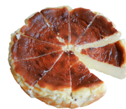
BURNT CHEESECAKE 2 POUND ฿1,900