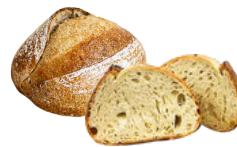
SOURDOUGH ฿100 / HALF LOAF ฿200 / WHOLE LOAF