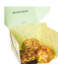
BOX OF 3 PCS ฿115