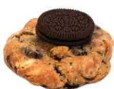
SOFT BAKE COOKIE OREO ฿125