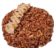
ROASTED COFFEE ALMOND 2 POUND ฿1,650