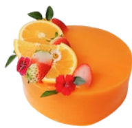
ORANGE CAKE 3 POUND ฿1,650