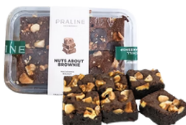
NUTS ABOUT BROWNIE ฿220