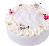
COCONUT CAKE 3 POUND ฿1,800