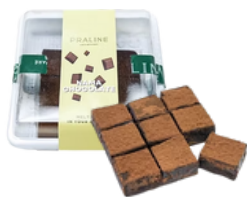
JAPANESE NAMA CHOCOLATE ฿150