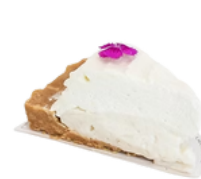
COCONUT CREAM PIE ฿180