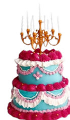
PRINCESS DIARY 2.5 POUND (BLUE) ₪2,200