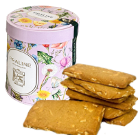
CAPPUCCINO COOKIE ฿270