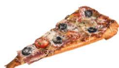
SALAMI PIZZA CROISSANT