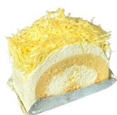
CHEDDAR CHEESE ROLL ฿180