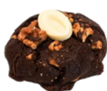
SOFT BAKE COOKIE WHIT CHOCOLATCHIP ฿125