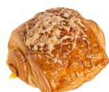
HAM CHEESE CROISSANT