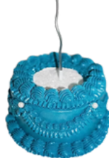
GLITTER CAKE 1 POUND ₪1,100