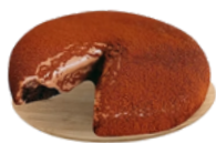
MOLTEN CHOCOLATE CAKE 2 POUND ฿1,100