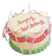
RIBBON CAKE 2 POUND ₪1,550