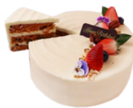
CARROT CAKE 2 POUND ฿1,700