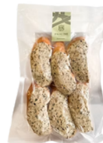
TRUFFLE MUSHROOM TOAST 6 PCS ฿160