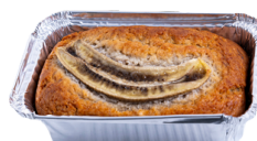
BANANA CAKE LOAF ฿190