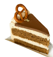
EARL GREY CHOCOLATE CAKE ฿170