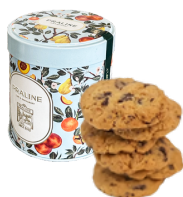
MACADAMIA DARK CHOC COOKIE ฿290