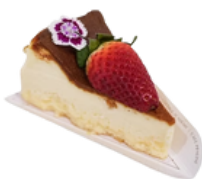
BURNT CHEESECAKE ฿170