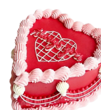
QUEEN OF MY HEART 1 POUND ₪990