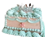
LADY CLAIR 1.5 POUND ₪1,150