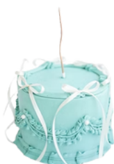
TIFFANY 2 POUND ₪1,550