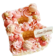
INITIAL LETTER BIRTHDAY CAKE 2 POUND ₪1,800