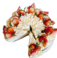
WHITE CHOCOLATE CHEESECAKE 2 POUND ฿1,900