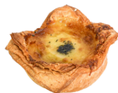
BLACK TRUFFLE CROISSANT