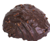
ROCHER CHOCOLATE CROISSANT