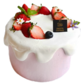
STRAWBERRY SNOW 2 POUND ฿2,000