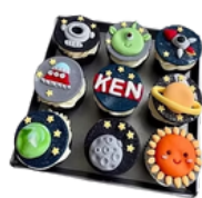
SPACE X CUPCAKE ฿160 / PC MINIMUM 9 PCS