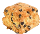
CHOC CHIP SCONE ฿70