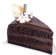
SOFT CHOC FUDGE CAKE ฿165