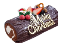
SANTA CHOCOLATE ROLL 1.5 POUND ₪1,100