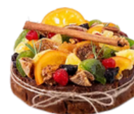
FRUIT CAKE 1 POUND ฿1,300