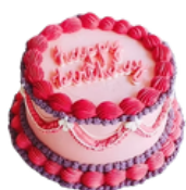
MAKE A WISH 1 POUND ₪950