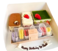
ASSORTED HAPPY BIRTHDAY CAKE MINIMUM 4 PCS PER SET. PLEASE CHECK THE DAILY CAKE MENU IN-STORE.