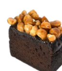
CHOC MACADAMIA CARAMEL ฿170