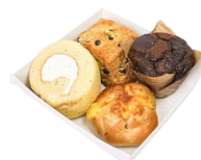
BOX OF 4 PCS ฿150