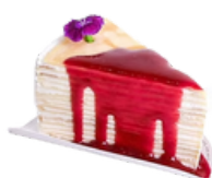
CREPECAKE STRAWBERRY SAUCE ฿175