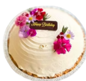
FRESH COCONUT PIE 2 POUND ฿1,450