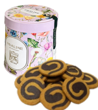
TWO TONE COOKIE ฿260