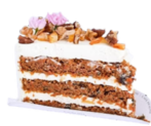
CARROT CAKE ฿170