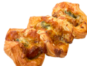
SAUSAGE JALAPENO CHEESE