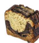
BANANA DARK CHOC 1 PC ฿135