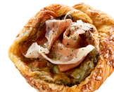
ITALIAN HAM PESTO