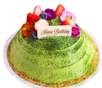
KYOTO MATCHA BANOFFEE 2 POUND ฿1,600