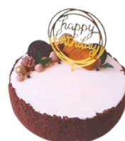
TOBLERONE CHOCOLATE CHEESECAKE 2 POUND ฿2,200