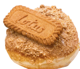
DONUT BISCOFF ฿95