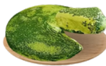
KYOTO MATCHA MOLTEN CAKE 2 POUND ฿1,200