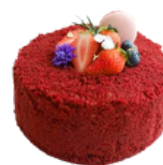
RED VELVET CREAMCHEESE 2 POUND ฿1,750