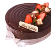
SOFT CHOC FUDGE CAKE 3 POUND ฿1,650