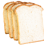
QUEEN BREAD ฿80 / HALF LOAF ฿160 / WHOLE LOAF