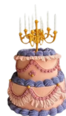
PRINCESS DIARY 2.5 POUND (PURPLE) ₪2,200