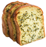
GARLIC LOAF ฿100 / HALF LOAF ฿180 / WHOLE LOAF