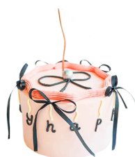
BABY PINK 2 POUND ₪1,550