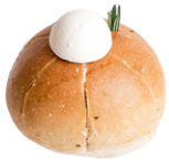
KOREAN GARLIC BREAD ฿85