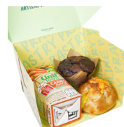
BOX OF 2 PCS AND JUICE ฿98