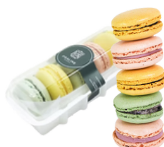
MACARON BOX 5 PCS ฿240