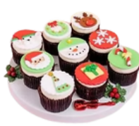
DEAR SANTA CUPCAKE 9 CUPS ₪1,100