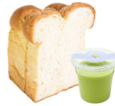
TOKYO HALF + PANDAN CUSTARD ฿150