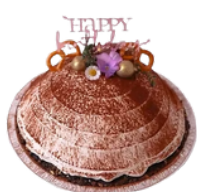
BANOFFEE PIE 2 POUND ฿1,200