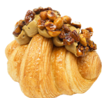
SIGNATURE PRALINE CROISSANT