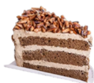
ROASTED COFFEE ALMOND ฿160