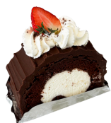
CHOC MASCAPONE ROLL ฿180