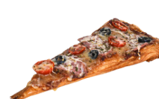
BACON PIZZA CROISSANT