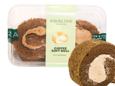
COFFEE SOFT ROLL ฿75