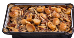
MACADAMIA TOFFEE CAKE LOAF ฿290