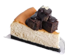
BROWNIE CHEESECAKE ฿180