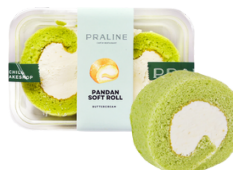
PANDAN SOFT ROLL ฿75