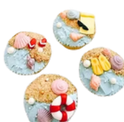
SUMMER BEACH CUPCAKE ฿145 / PC MINIMUM 9 PCS