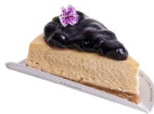
NEW YORK CHEESE CAKE ฿170