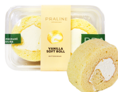
VANILLA SOFT ROLL ฿75