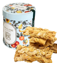
CRISPY ALMOND ฿280