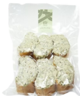
GARLIC BUTTER BREAD 6 PCS ฿100