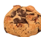
SOFT BAKE COOKIE CHOCOLATCHIP ฿125