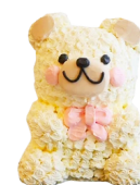
YUMMY BEAR 2 POUND ₪2,000