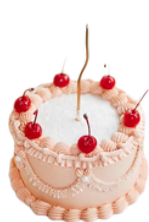
CHERRY QUEEN GLITTER 1 POUND ₪1,100