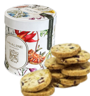
PISTACHIO CRANBERRY COOKIE ฿280