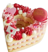
MY HEART MY SOUL 2 POUND ₪1,550