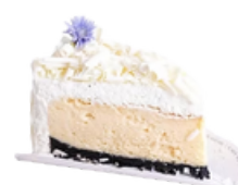
WHITE CHOC CHEESECAKE ฿190