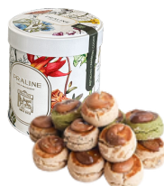
SINGAPORE COOKIE ฿260