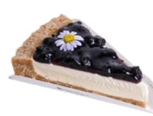
BLUEBERRY PIE ฿155