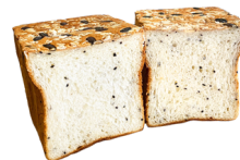
WHOLE GRAIN SHOKUPAN ฿90 / HALF LOAF ฿180 / WHOLE LOAF