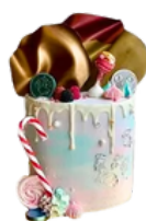
LOLLIPOP DRIPPED CAKE 2 POUND ₪1,990