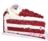
RED VELVET CAKE ฿175