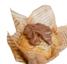
NUTELLA BANANA (+20 BAHT)