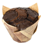
CHOC CHIP MUFFIN