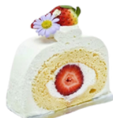
STRAWBERRY ROLL ฿170