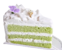
BAITOEY COCONUT CAKE ฿160