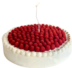
RASPBERRY CREAM CHEESE PIE ₪7,000 / 4 POUND (24 CM) ₪8500 / 5 POUND (28 CM)