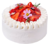
STRAWBERRY SHORTCAKE 3 POUND ฿2,400