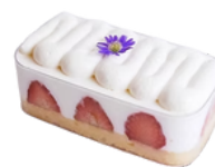
STRAWBERRY SNOW CAKE ฿255