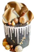
C11 LUXURY BLACK GOLD DRIPPED CAKE 2 POUND ฿1,990