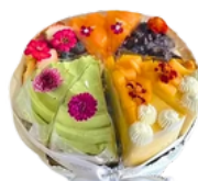
ASSORTED HAPPY BIRTHDAY CAKE MINIMUM 4 PCS PER SET. PLEASE CHECK THE DAILY CAKE MENU IN-STORE.