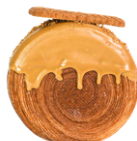
TIMBERING BISCOFF COOKIE