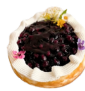
NEWYORK CHEESECAKE 3 POUND ₪1,800