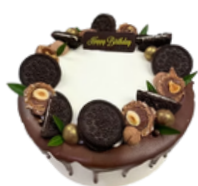
MONKEY SHOCK BANANA CAKE 3 POUND ฿1,650