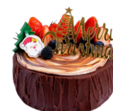
WOODLAND CHOCOLATE FUDGE CAKE 1 POUND ₪1,400