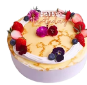
CREPECAKE WITH STRAWBERRY SAUCE 2 POUND ฿1,750