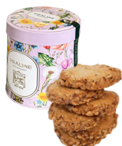
CHEDDAR CHEESE COOKIE ฿280