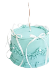
TIFFANY 1 POUND ₪890