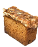
MATOOM CAKE ฿130