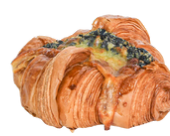
SPINACH CHEESE CROISSANT