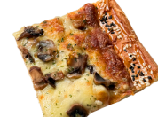
MUSHROOM CHEESE PIE