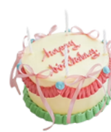
BABY PINK 1 POUND ₪890