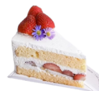
STRAWBERRY BABY BOOM ฿240