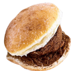
DONUT TIRAMISU ฿95