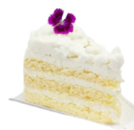
COCONUT CAKE ฿170