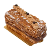
MILLE FEUILLE ฿250