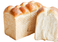
TOKYO MILK LOAF ฿80 / HALF LOAF ฿160 / WHOLE LOAF